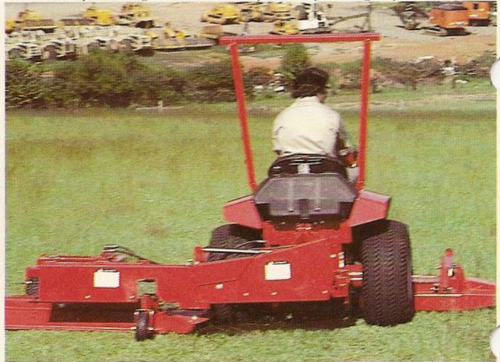
Wing mower power source is line rear PTO.