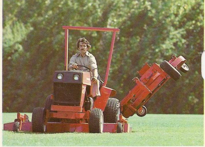
Optional wing lifted and lowered hydraulically with finger tip control.