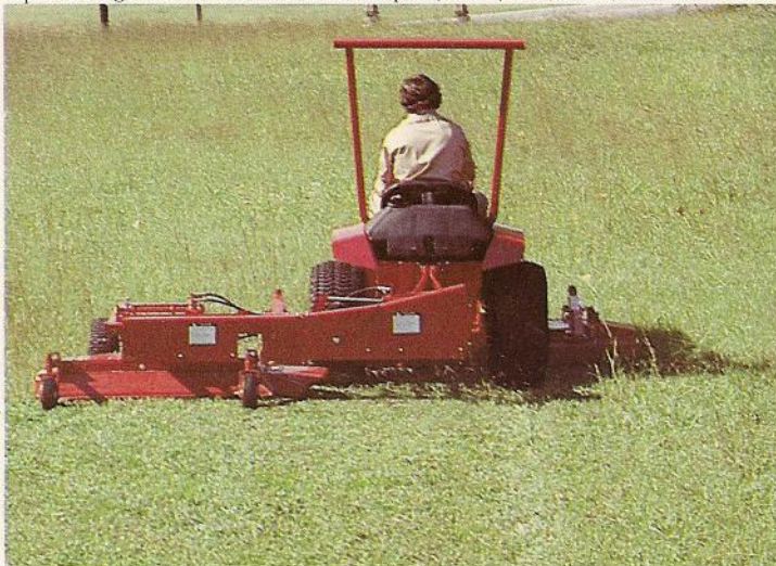
Two mowers, with matched heights of cut adjustments provide finished appearance.