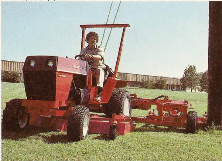
Optional wing cuts within one inch (2.54cm) of poles, fences, trees, shrubs, and other obstacles.