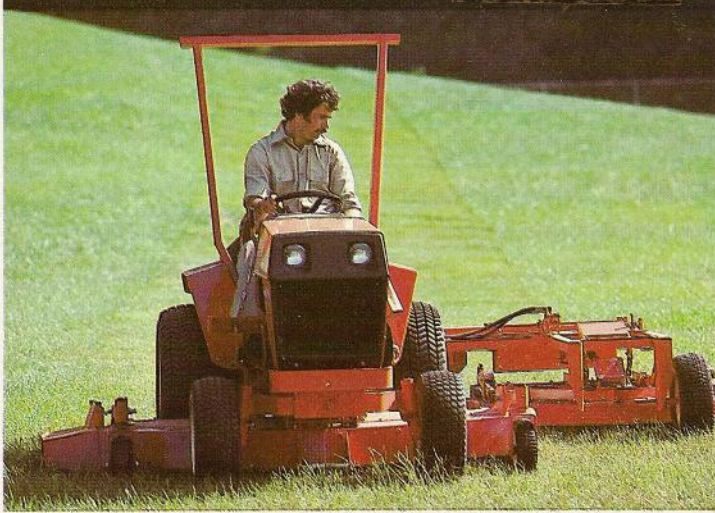
Optional equipment enables the GMT 9000 to cut a full 9'11" (3.05m) swath.